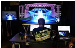
Work at the 3D Visualization studio with LightConverse.

Lollapalooza's return to São Paulo, Brazil earlier this year was made all the more successful by Electralight , in partnership with LPL Lighting Productions , and their use of LightConverse visualization software.